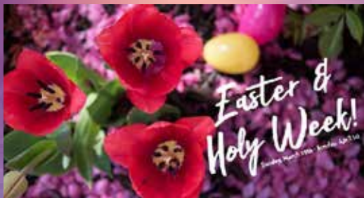
2018 Easter Mailer