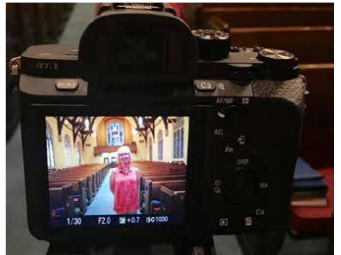
Top: Interviewing members for Stewardship videos Bottom: Rally Sunday & Dundee Day Mailer