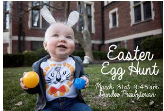
Campbell Cotton promoting the Easter Egg Hunt