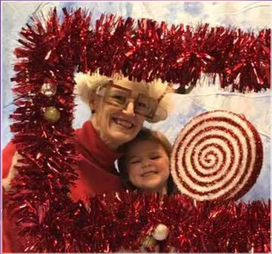
Holly Jolly photo booth