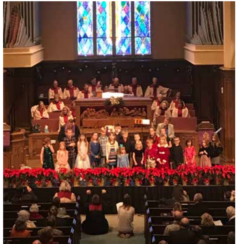
Top: Kid's choirs singing on Dec. 16 at 11am Bottom: Cantata 2018 with dancers